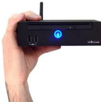
Front View, shown with optional Wifi