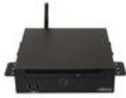
Front View with Mounting Brackets Installed