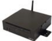
Front View with Mounting Brackets Installed