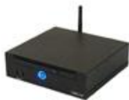
Front View, shown with optional Wifi