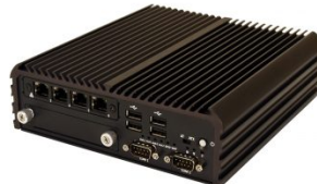
LPC-830/835 Front View