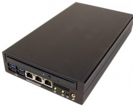
LPC-480G4M Front View